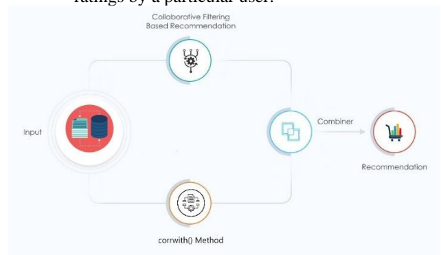
Fig 5: Hybrid Recommender Model