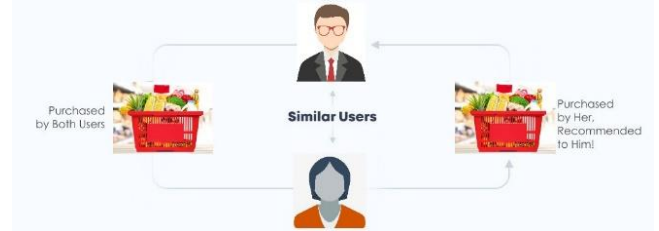
Fig 4: Collaborative filtering Recommender Model

Our Model uses the enhanced Singular Value Decomposition (SVD++). This technique will customize our recommendation according to the same user group based on the above user-item interaction matrix and minimize Root Mean Square Error (RMSE) that is calculated by Kfold Cross Validation and give great recommendations.