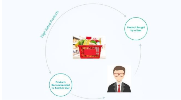
Fig 2: Popularity Based Recommendation Model