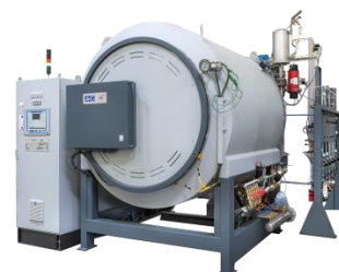
Fig. 2. Gas nitriding Equipment