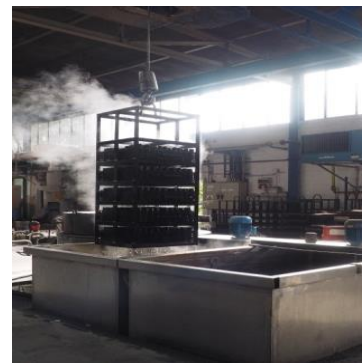
Fig. 1. Salt bath nitriding Equipment

Salt bath Nitro carburizing is a thermo chemical process in which nitrogen diffuses on to the substrate, which combines chemically and forms Fe 3 N outer layer which is hard and ductile. Salt bath Nitriding was done in a alumina crucible using a muffle furnace. The bath consists of salts like potassium nitrate (K 2 NO 3 ), sodium carbonate (Na 2 CO 3 ) and carbamide (CO (NH 2 ) 2 ). When suitable temperature is attained salt melts. Now the specimens are immersed in a salt bath for certain soaking time. The nitrided samples were taken out and then oil quenched. The salt bath nitrocarburising was performed at 480 c for 3 h.[2]