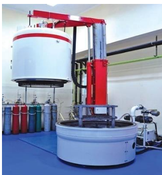
Fig. 3. Plasma nitriding Equipment

The nitriding cycle begins by placing the product into the vacuum chamber and evacuating the chamber to a desired vacuum pressure. Upon reaching the desired vacuum, the unit is back-filled with a process gas to begin the preheating cycle. The standard preheating cycle ranges in temperature from 850 to 1050 Fahrenheit. The process gas is ionized by a voltage that is applied to the product.