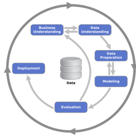
Fig. 3. CRISP-DM Model [6]