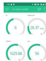
Fig 5.3: Blynk App