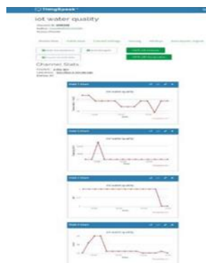
Fig 5.2: Thingspeak