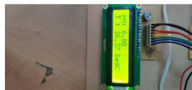
Fig 5.1: LCD Display

In summary, the smart water quality monitoring system offers numerous benefits for water management practices by providing real-time monitoring, improving data accuracy, and enabling data analysis. It has the potential to enhance water quality management and promote sustainable water resource management practices.