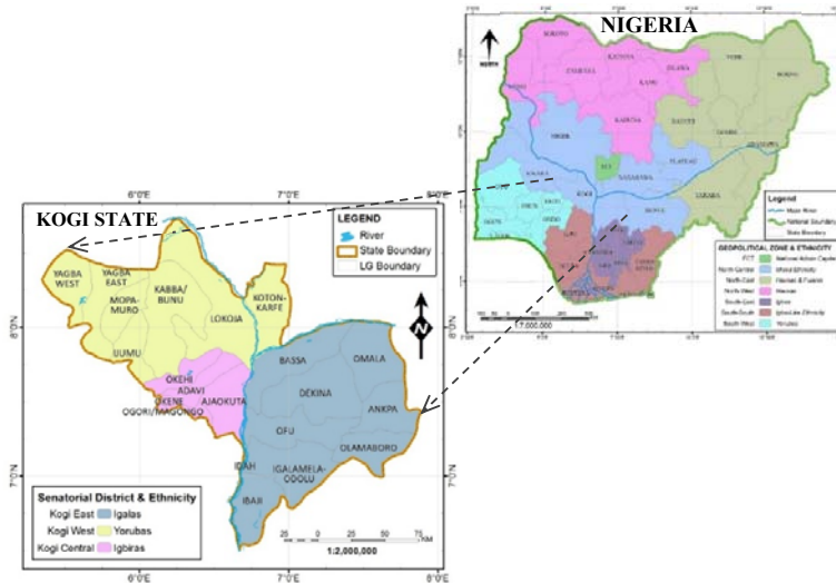
Figure 1 Nigeria Showing Kogi State with the LGAs therein

Kogi State in Nigeria, a LMIC, is the study area of this study. It is well-acknowledged that in terms of geodemographic characteristics, Kogi State is a microcosm of the entire country; hence, it is a good representative of Nigeria (Omotola, 2008). Figure 1 is a map of Nigeria, showing Kogi State which in turn shows extant Local Government Areas (LGAs). Figure 3A shows extant ward zoning systems for the three (3) select LGAs of this study.