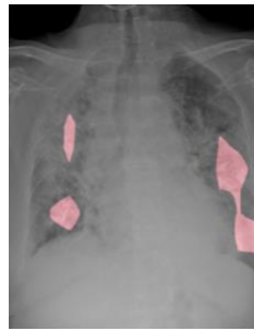
Figure 2: Highlighted chest X-ray of COVID-19 case

GSInquire uses a generator-inquisitor pair of functions that work together to form an interpretation of a decision. The generator function creates new neural networks based on a set of possible seeds. Then, the inquisitor function takes these new networks and determines which parameters influence decisions. This allows for CNNs to be audited to ensure that the decisions are based on relevant information. Figure 2 shows the critical factors identified by GSInquire in sample chest X-ray image of COVID-19 positive case [2]. According to the interpretation by GSInquire, the COVID-Net mainly focuses on the highlighted areas of the lungs in the chest X-ray images, which are considered as the main critical factors in determining whether the image is of a patient with COVID-19 infections [2].