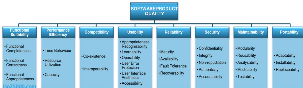
Figure 1: Product quality characteristics ISO 25010 Standard [14]