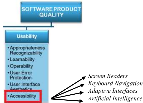
Figure 3. Relationship between the Usability characteristic and the proposed model

Figure 3 graphically shows how the proposed model is applied within the usability characteristic and its accessibility subcharacteristic.