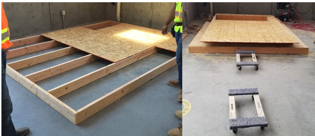
Figure 2. Construction of the stage and loading panels on dollies