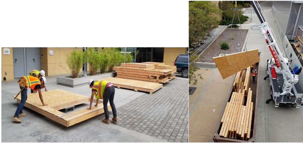
Figure 3. Stacking panels and loading into the container